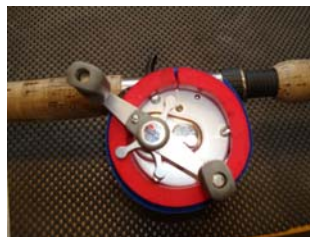
Go on a Trip

See You all January 3rd at the VFW Ltl. Angel